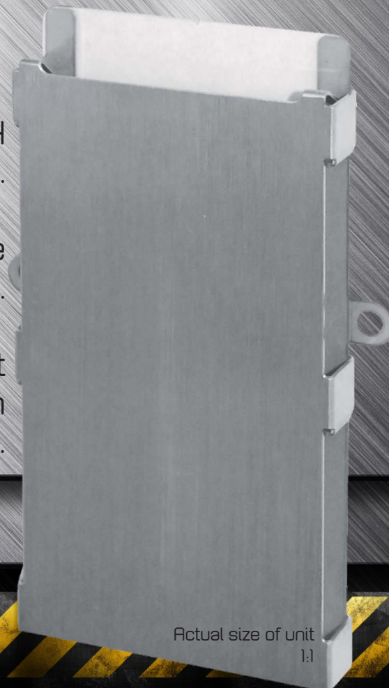
Actual size of unit 1:1

transparent PET-monitorcard with integrated pheromone lure.