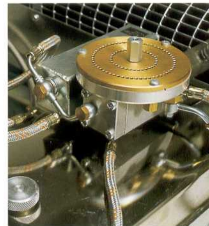
Air intake valve without filter acting as silencer.