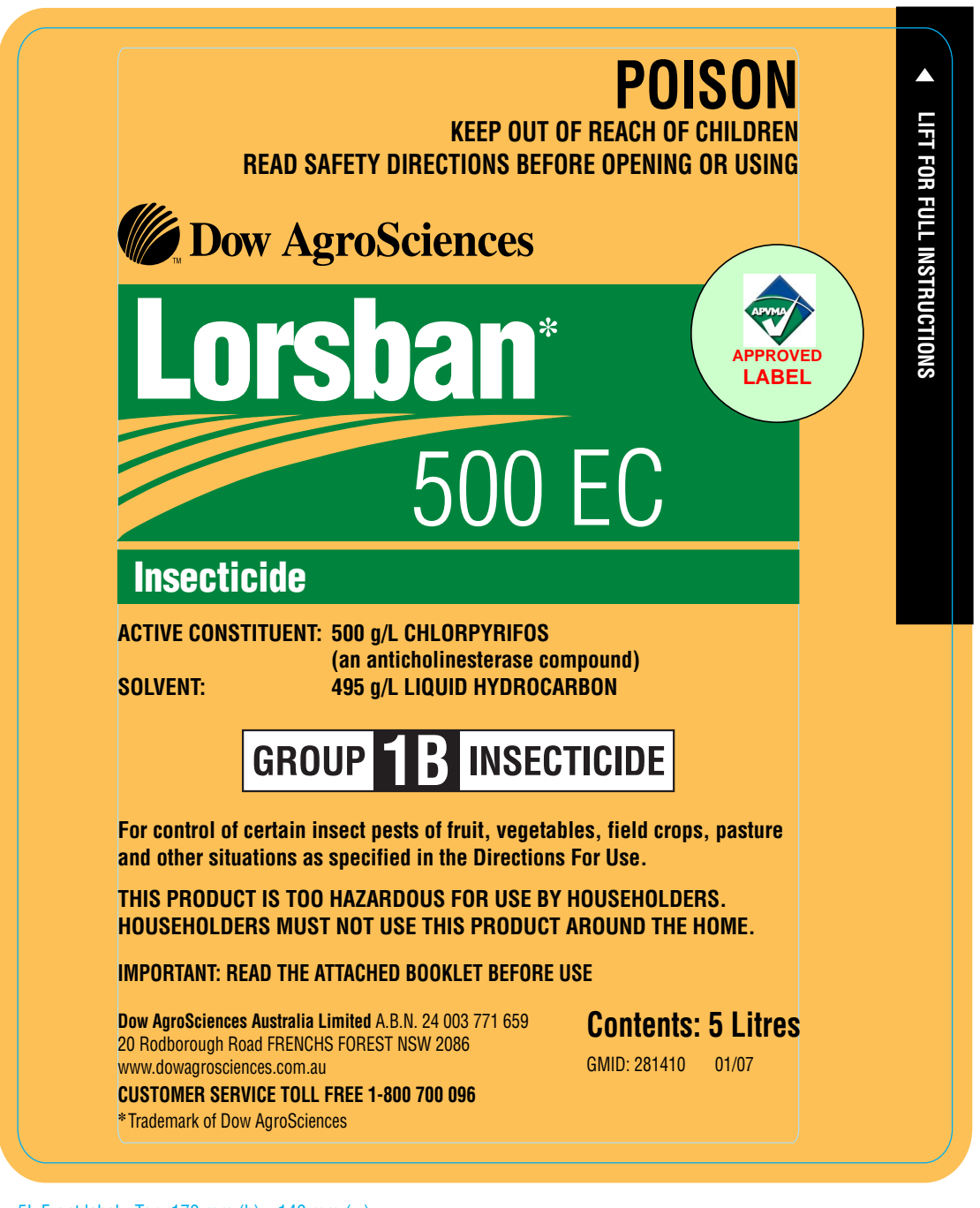
5L Front label - Top: 170 mm (h) x 140 mm (w)